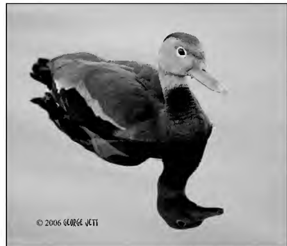
Black-bellied Whistling Duck on June 6, 2006.